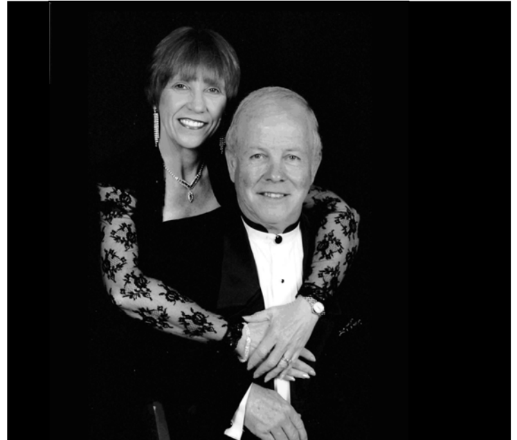
Phase IV-VI HALL