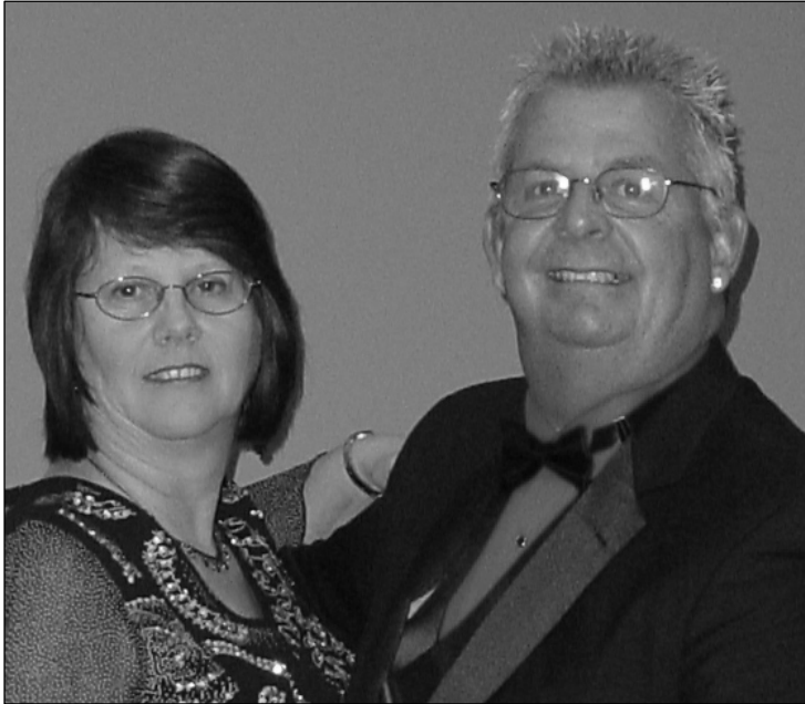
Phase III-IV HALL